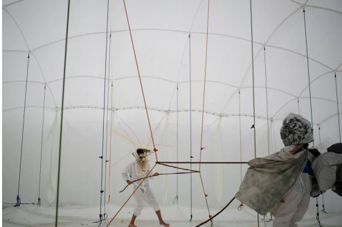
Divergent spheres of activity: European Architecture Student Assembly (EASA) workshop, 2017.

What started out as a talk given to a number of small societies back in 1928, evolved into an essay which came to set in motion a set of policies which we still now deal with on a daily basis. The title of this essay was “Economic Possibilities for Our Grandchildren” and the author was John Maynard Keynes, a British economist originally trained as a mathematician. In the essay, Keynes openly addresses the reigning economic and social pessimism of his time with a set of practical and uplifting proposals. The goal, as the title of the essay so clearly states, was to act now in order to allow for a different, better future for the generations ahead. If we expect today’s students to move towards the creation of a better, fairer, healthier environment, they must be provided with the confidence to overcome the fear of action in the face of extinction. What would an architectural education which widens rather than stifles the architectu-