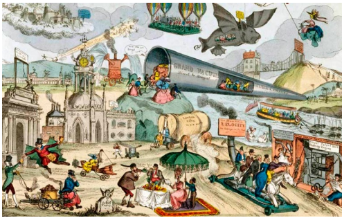
The March of Intellect. "Lord how this world improves as we grow older." William Heath, 1828.

Learning is one of the defining aspects of being human. Taking the decision to study architecture, one participates in the collective desire to learn, produce knowledge, instigate new conversations, build on old ones, and make a lasting difference in the built environment for future generations. This year's cycle investigates possible paths that shift the understanding of architectural education through a series of pointed questions that invite diverse formats of responses.